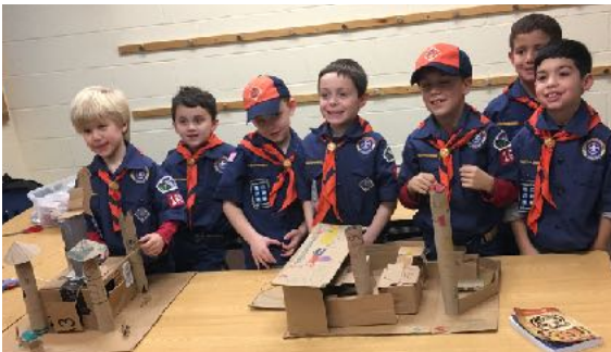
Some previously-owned uniforms may be available, if needed.

A “Class A Uniform” must be purchased from the Scout Store. We recommend only buying the BLUE shirt (with associated patches) and the belt; hat and pants are optional. During their time in the Webelos rank, scouts will need to upgrade to a TAN shirt. This is our dress uniform that we wear to most Den and Pack Meetings unless specified otherwise. Cost of uniforms is approximately $50-70. Please see a leader for one of our specially-made “1600” red & white Pack number patches. All Scouting items can be purchased at the Minsi Trails Council Scout Store at 991 Postal Road, Allentown, PA 18109. (They can sew your patches on too!)